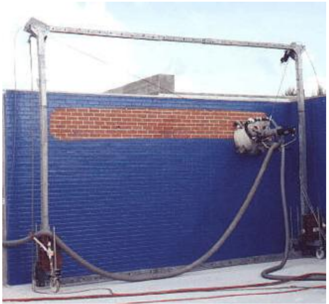
Figure 6 Equipment for removing PCB-containing paint.

PCB paint has been applied inside the barn, because this was the only coating at that time strong enough to withstand gases arising from the manure.