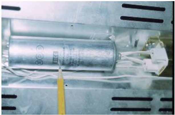
Figure 2. A typical PCB-capacitor, inside a lighting fixture.