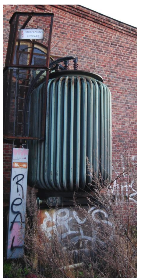
Figure 9 Typical PCB-containing transformer.

PCB oil has low flammability, and therefore is of little value as fuel oil. It has therefore, been greatly diluted with other oil. It is usually very expensive to treat PCB-containing equipment and there is a tendency to illegally get rid of it.