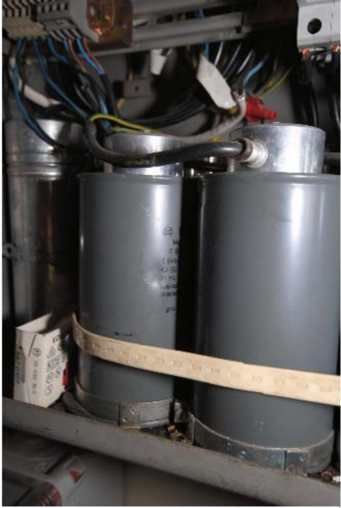
Figure 1 Here you can see PCB-capacitors in a fuse box.

Capacitors in fluorescent light fixtures contain 30-100 grams of PCB, while other small capacitors can contain up to 300 grams of PCB. Because a capacitor can have widely different sizes, this data is imprecise. A Norwegian manufacturer stated that they mainly produced 4\mu F capacitors, and these contained 20 grams Clophen, a PCB oil. These capacitors were mostly used in indoor lighting fixtures. The Norwegian producer also produced some 12 \mu F capacitors with 500-1000 grams Clophen. For road lighting, it is most often used 8 to 25 \mu F capacitors, and these contain even more PCBs.