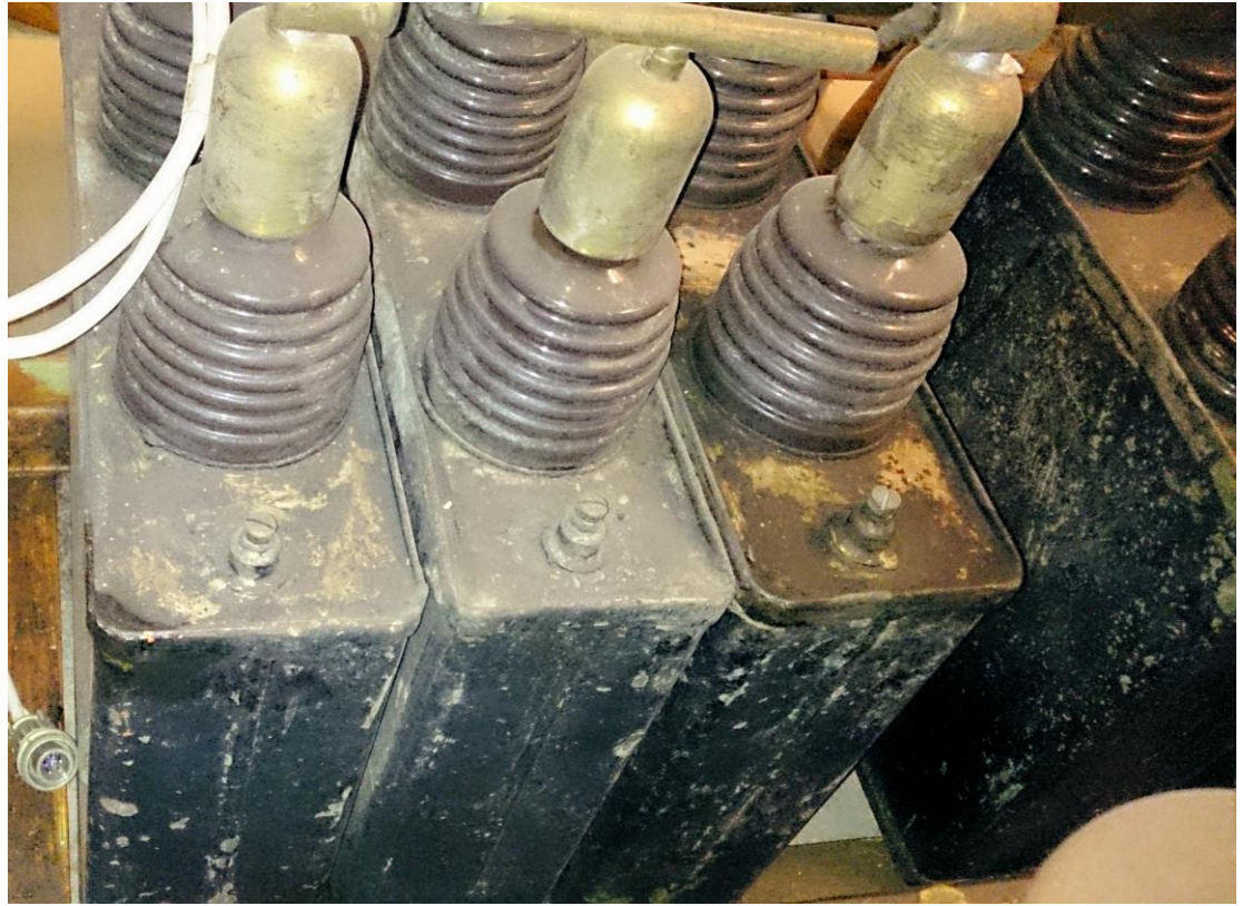
Figure 2 Discarded PCB-containing large capacitors from the 1950s.