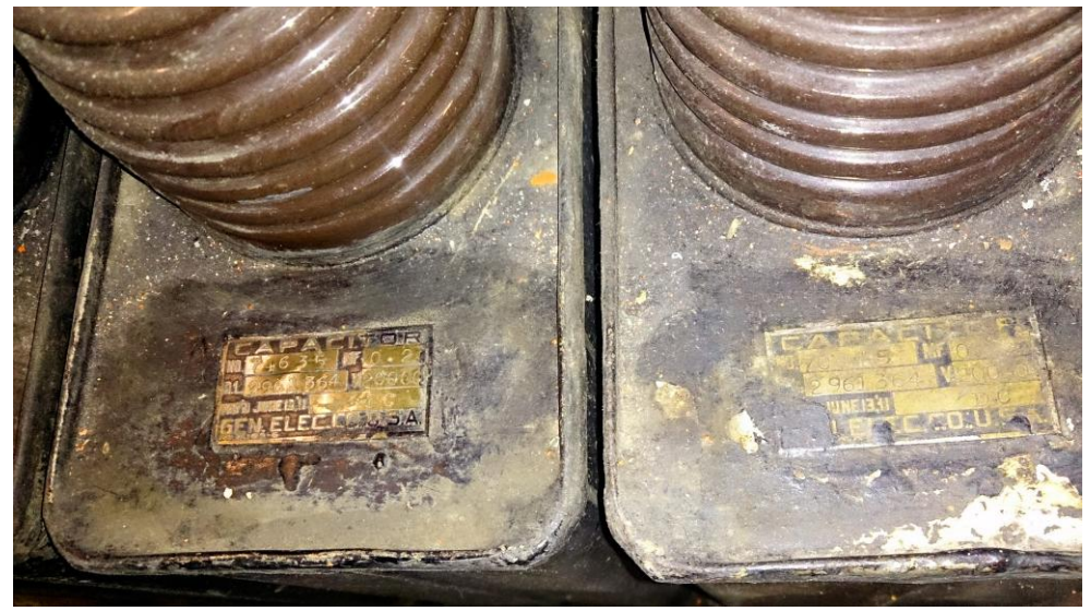
Figure 3 The name plate on these capacitors clearly indicate that these are manufactured by General Electric Corporation, USA.