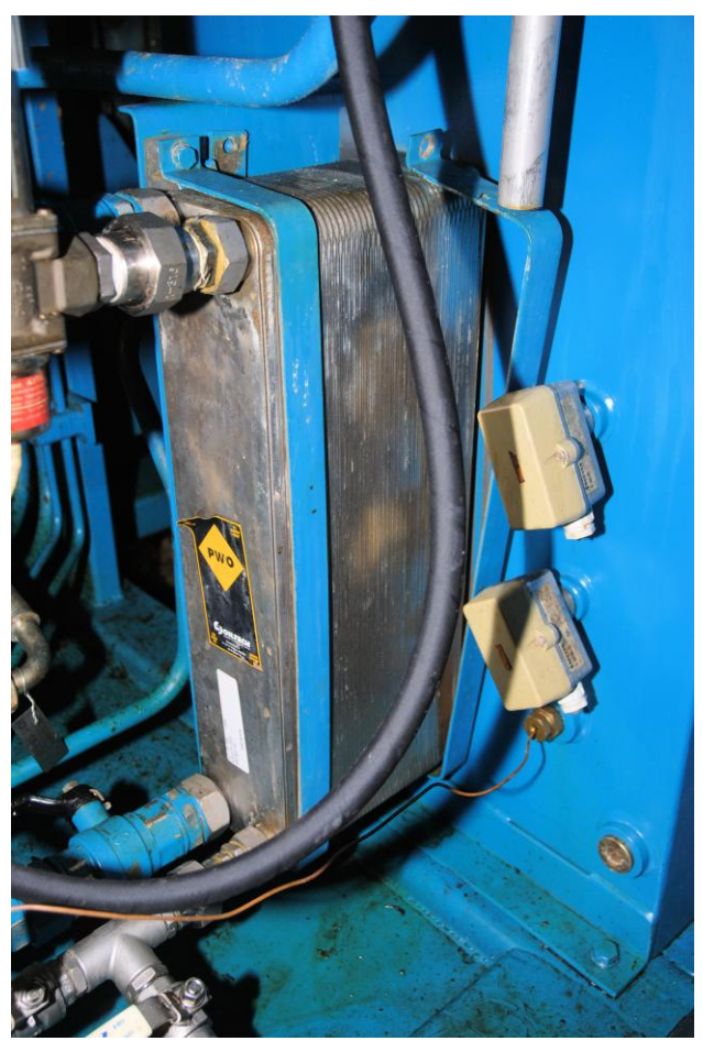
Figure 5 This is a modern heat exchanger (labeled "PWO"), but we assume old ones look similar to this.

Today, polydimethylsiloxane has replaced PCBs in such applications.