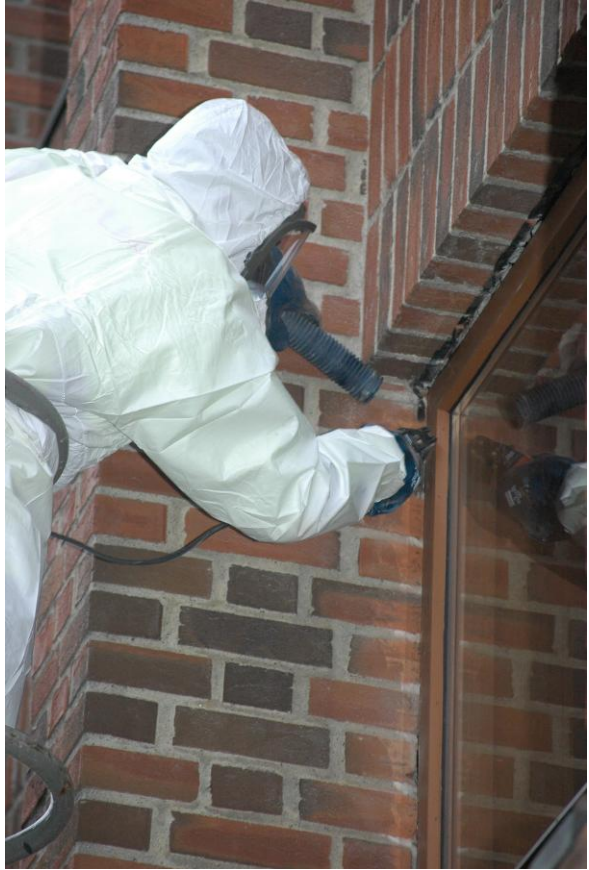
Figure 7 Removal of sealant around a window.

Compilation of PCB applications for owners and public officials