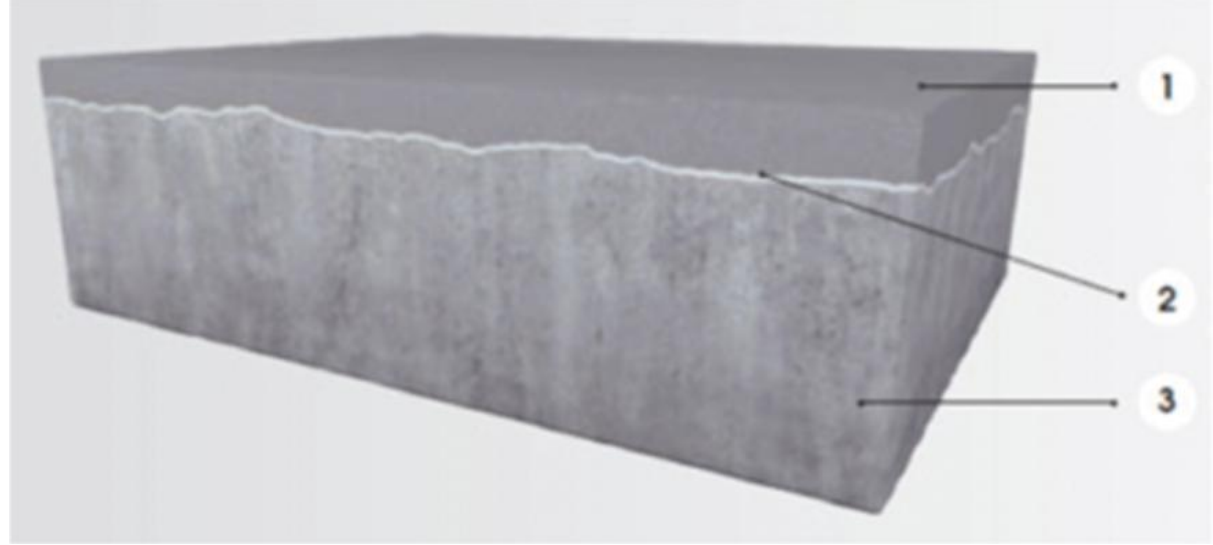
Figure 4 This is an illustration on the use of PCB in the top leveling mass (1). Picture by Weber corporation.

Floorings with 220 mg PCB/kg can be found in Norway. PCBs are also found in conventional concrete at various concentrations, up to 55 mg/kg. This was possible because Borvibet was added in portions of the concrete, where it was important to get the concrete to flow well into all nooks and corners of the formwork. PCBs can also originate from oil.