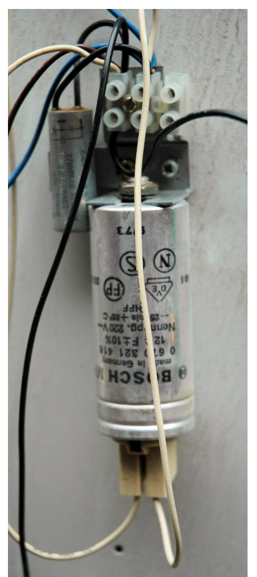
Figure 1. Typical aluminum can capacitor, might contain PCB.

Modern electrolytic capacitors are constructed with semiconductive polypropylene without PCBs. Capacitors in aluminum cans can be regarded as PCB-containing, whilst plastic cans probably do not contain PCB.