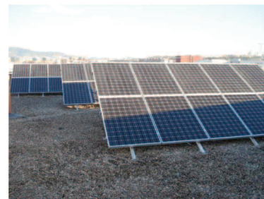
Photovoltaic solar panels