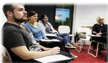
Barcelona Activa, Oct 2012