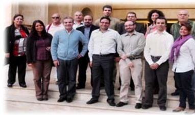
Hammamet, Nov 2012