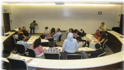
American University of Beirut, Jun 2012