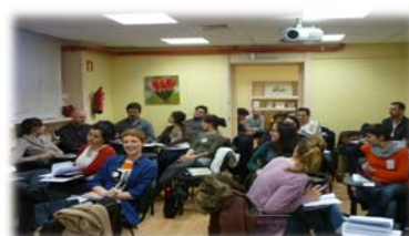
Incubaeco Madrid, Apr 2013